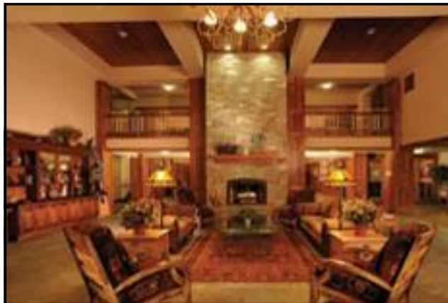
The Running Y Ranch Lodge

Live, Work and Play JELD WEN. COMMUNITIES