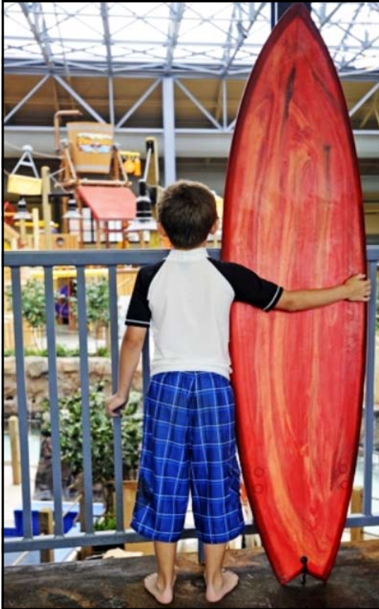
Silver Rapids Waterpark at Silver Mountain