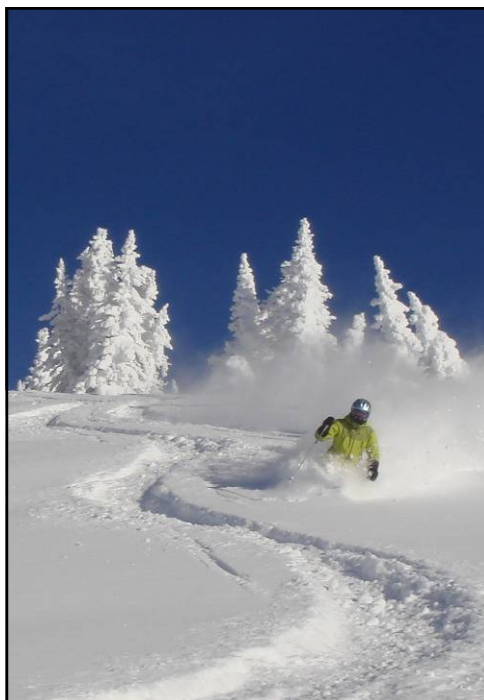
Skiing at Silver Mountain Resort

Points are earned at the Running Y Ranch, Eagle Crest Resort, and Silver Mountain Resort. Group stays will be awarded at half of the above points when paid individually. No points are awarded for group stays paid to a master account.