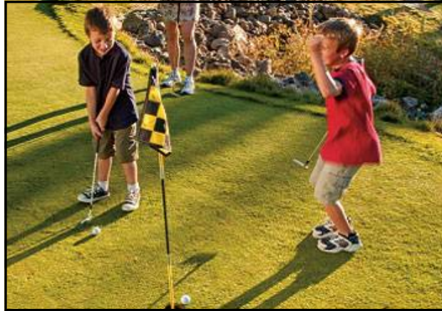
The Putting Course at Eagle Crest Resort